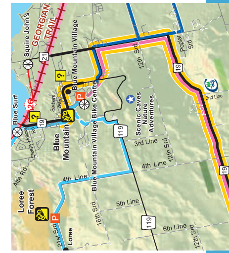
Blue Mountain Village